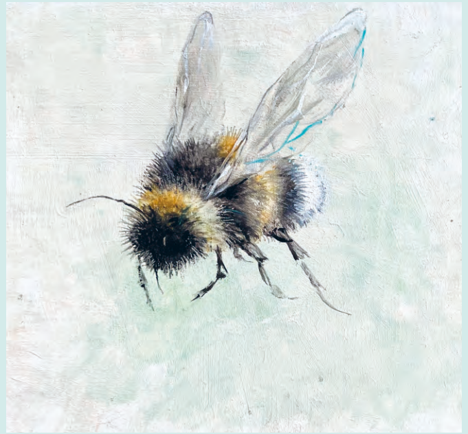
Bee Too oil on gesso panel, 12 x 14 cm