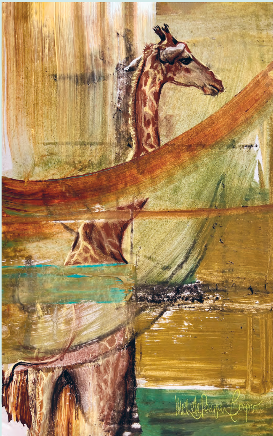
Giraffe on Abstract mixed media 37 x 24 cm