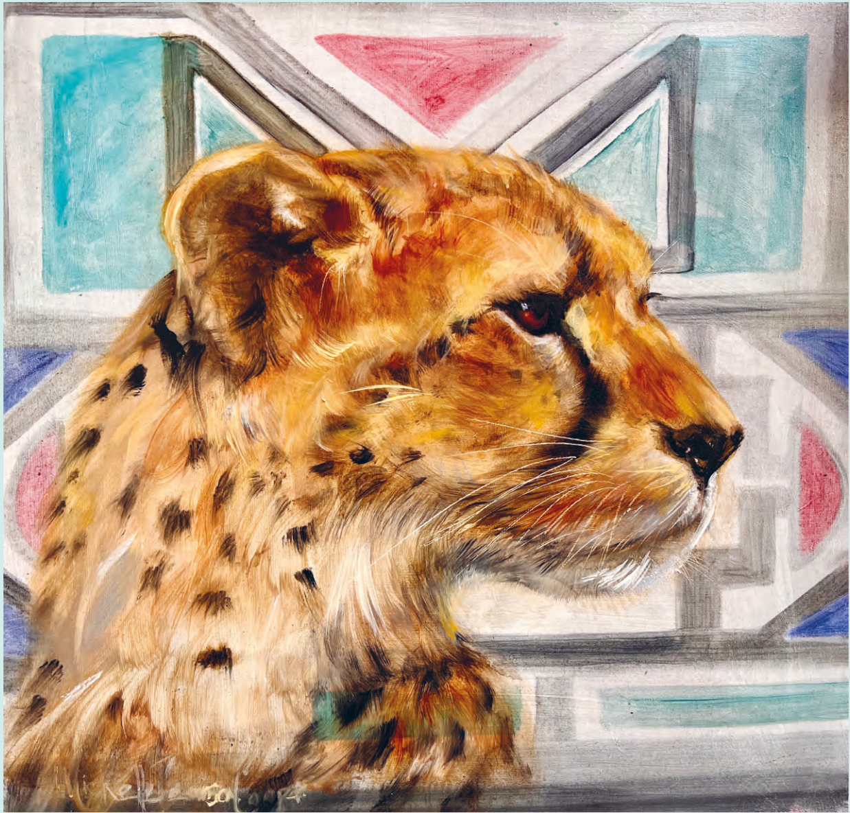
Cheetah on Ndebele oil on panel, 30 x 30 cm