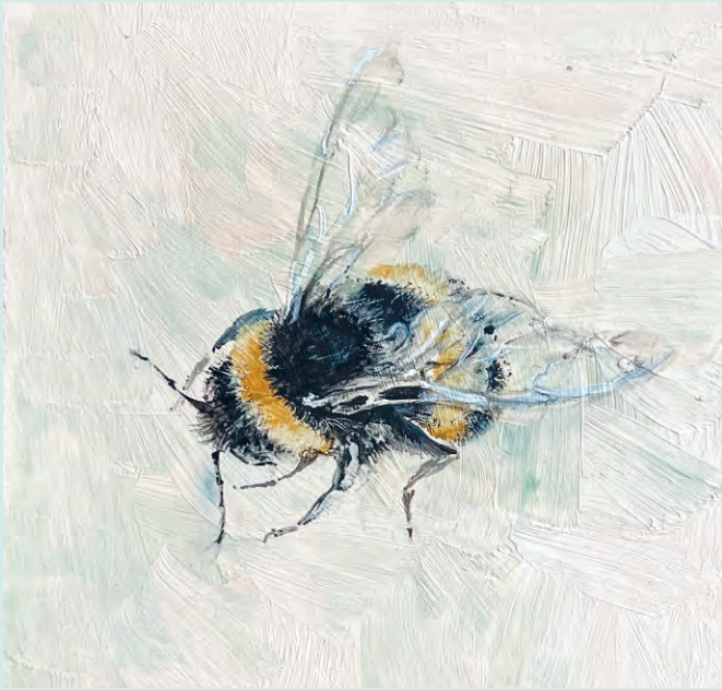
Bee One oil on gesso panel, 12 x 14 cm