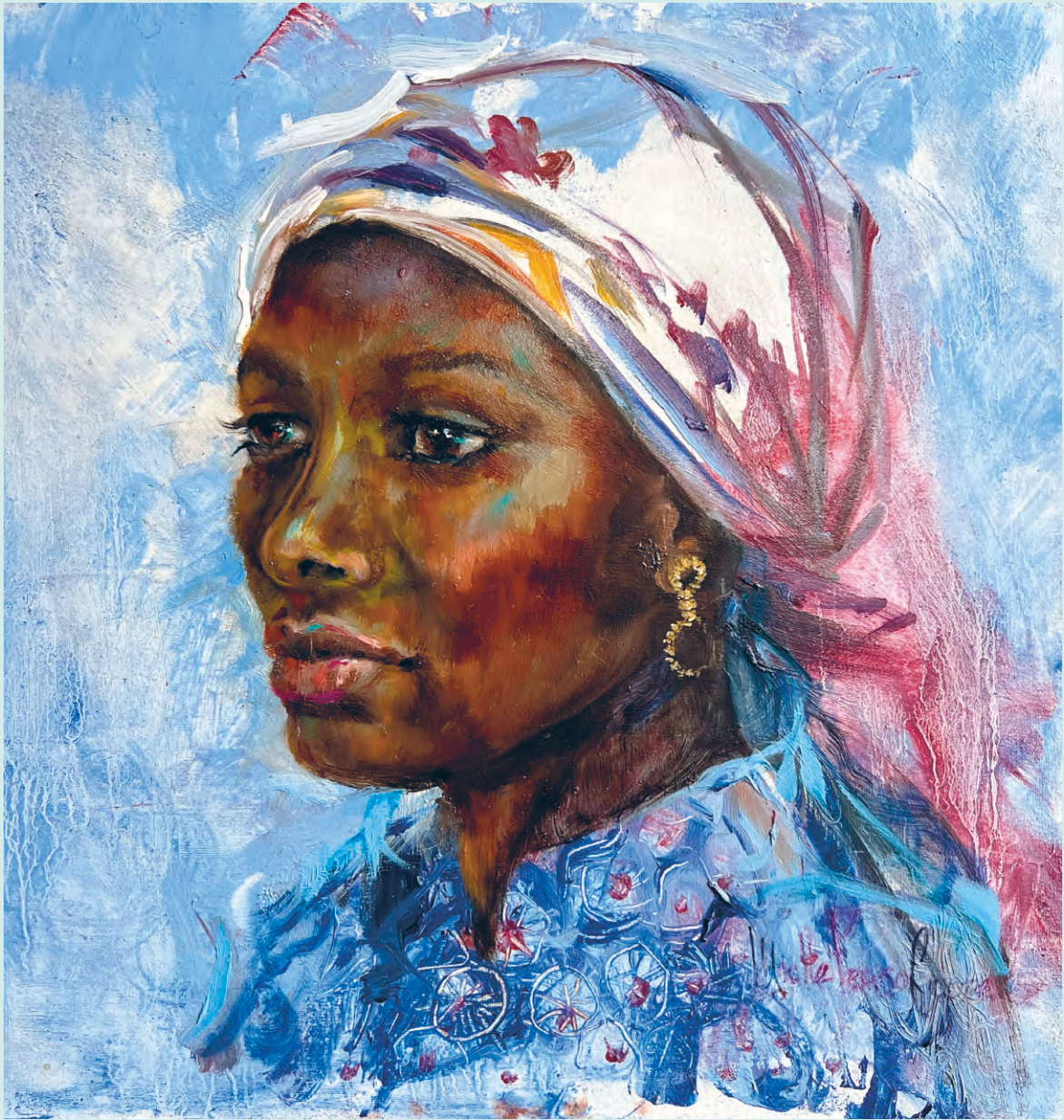
Angelina oil on panel, 30 x 30 cm

'Angelina wears a Shwe Shwe dress; a traditional Xhosa design and recognised by its intricate geometric print.'