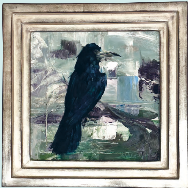
Rocky the Rook oil on panel, 30 x 30 cm