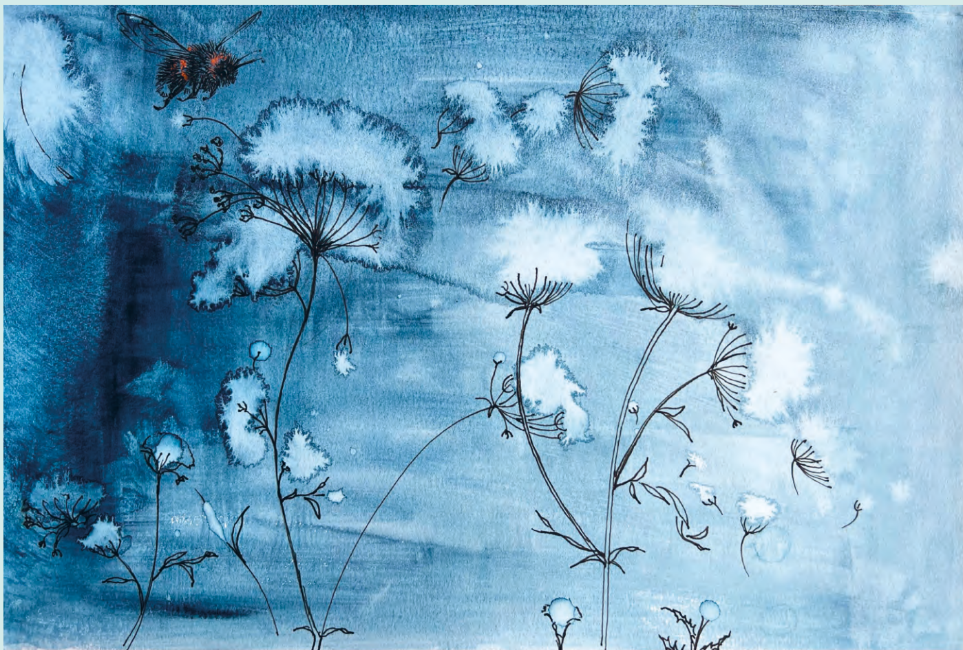
Bedtime ink wash on paper, 19 x 28 cm