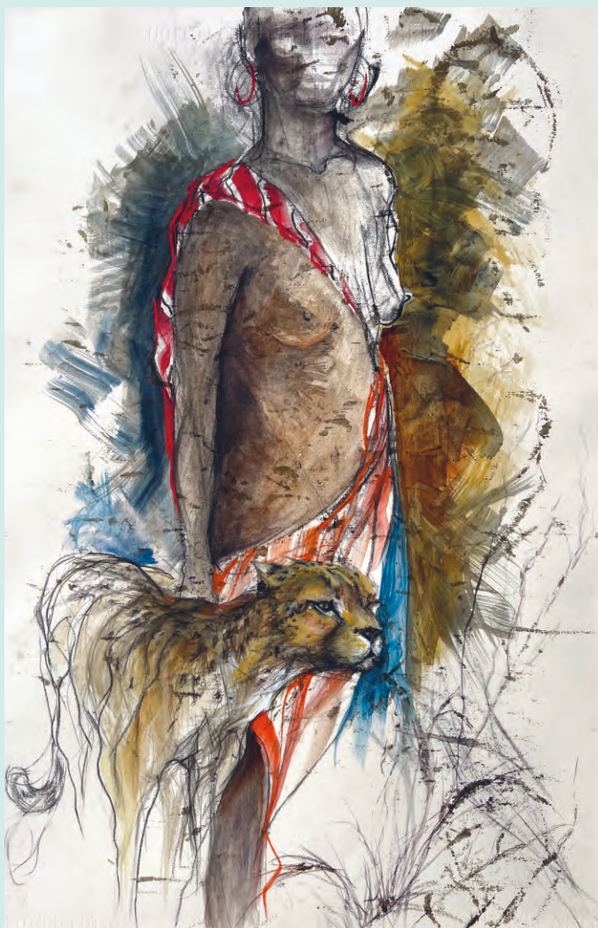
Maasai & Cheetah mixed media, 55 x 35 cm