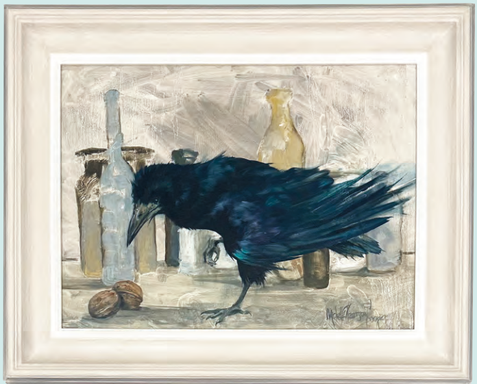
Rook & Walnuts oil on panel, 30 x 40 cm