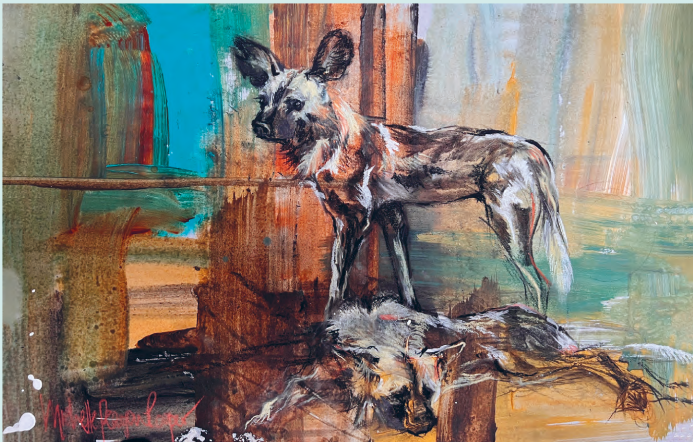
Wild Dogs Resting on Abstract mixed media, 24 x 37 cm