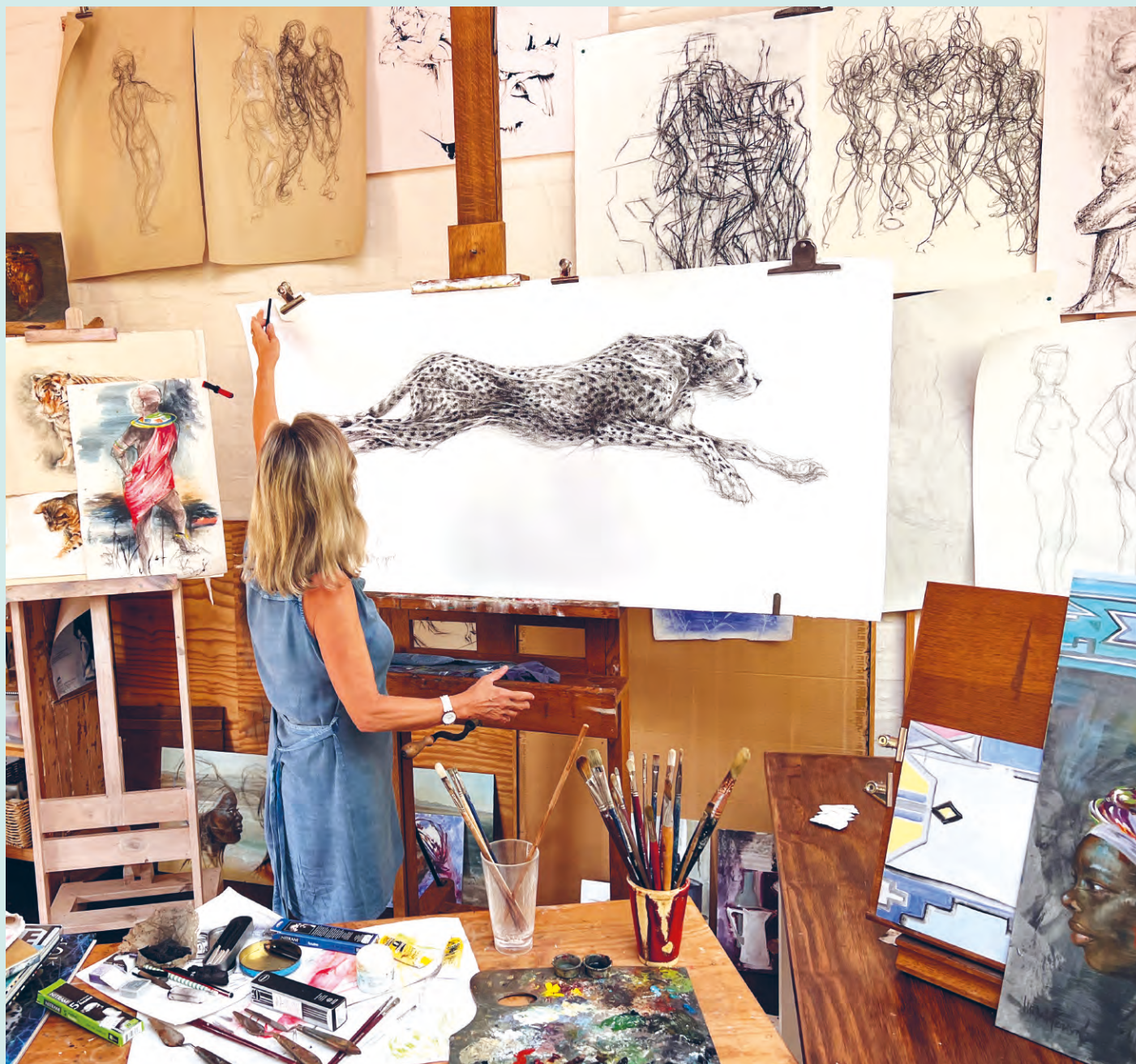
In the Studio 2023