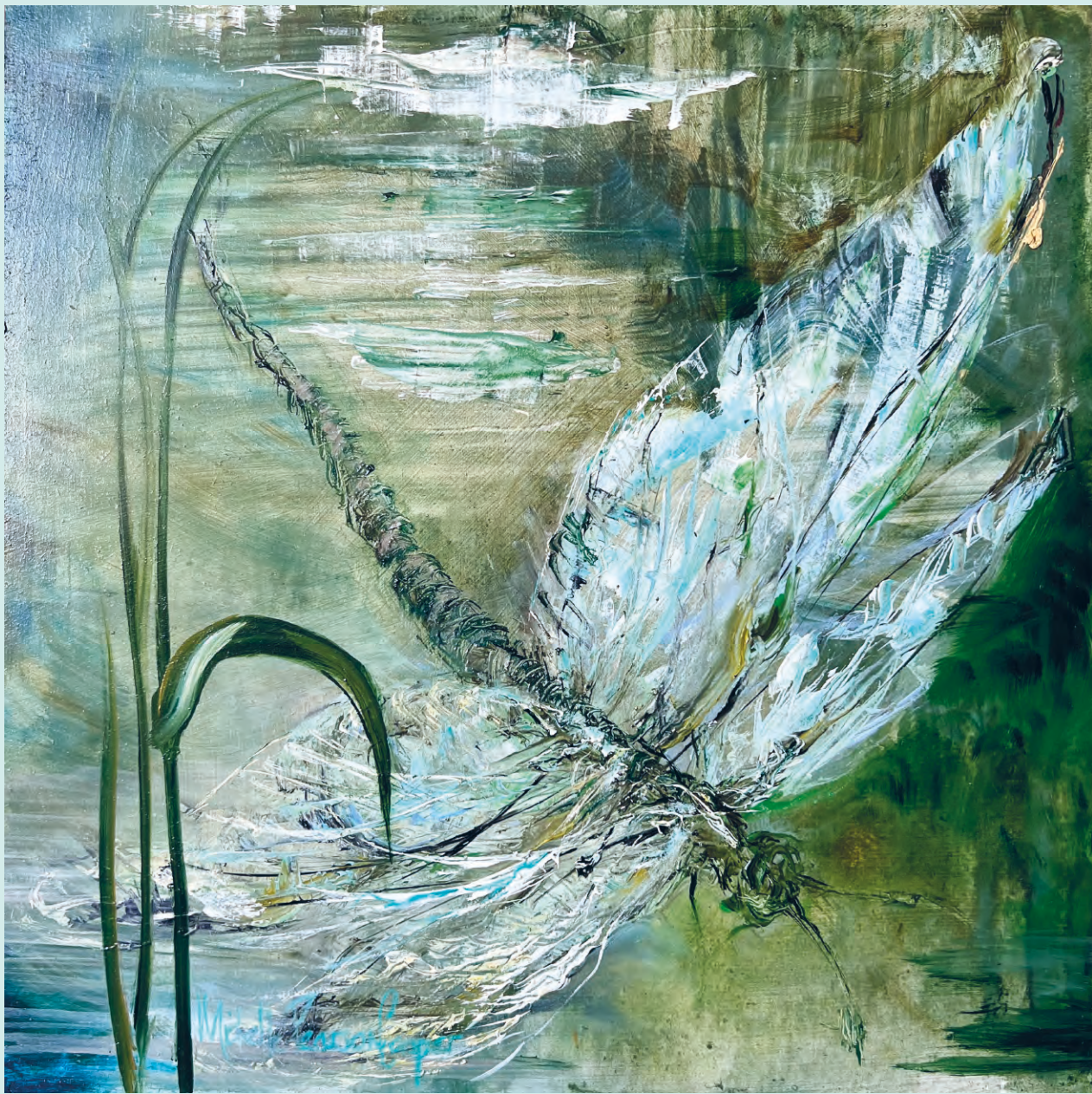
Madam Dragonfly oil on panel, 30 x 30 cm