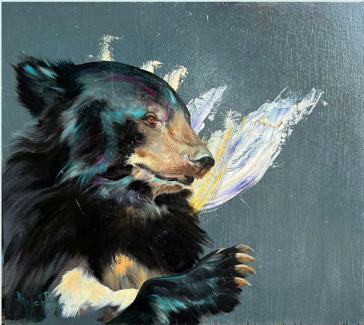
Moon Bear oil on panel, 35 x 40 cm