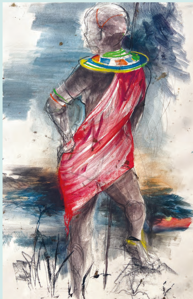
Maasai at Sunset mixed media, 55 x 35 cm