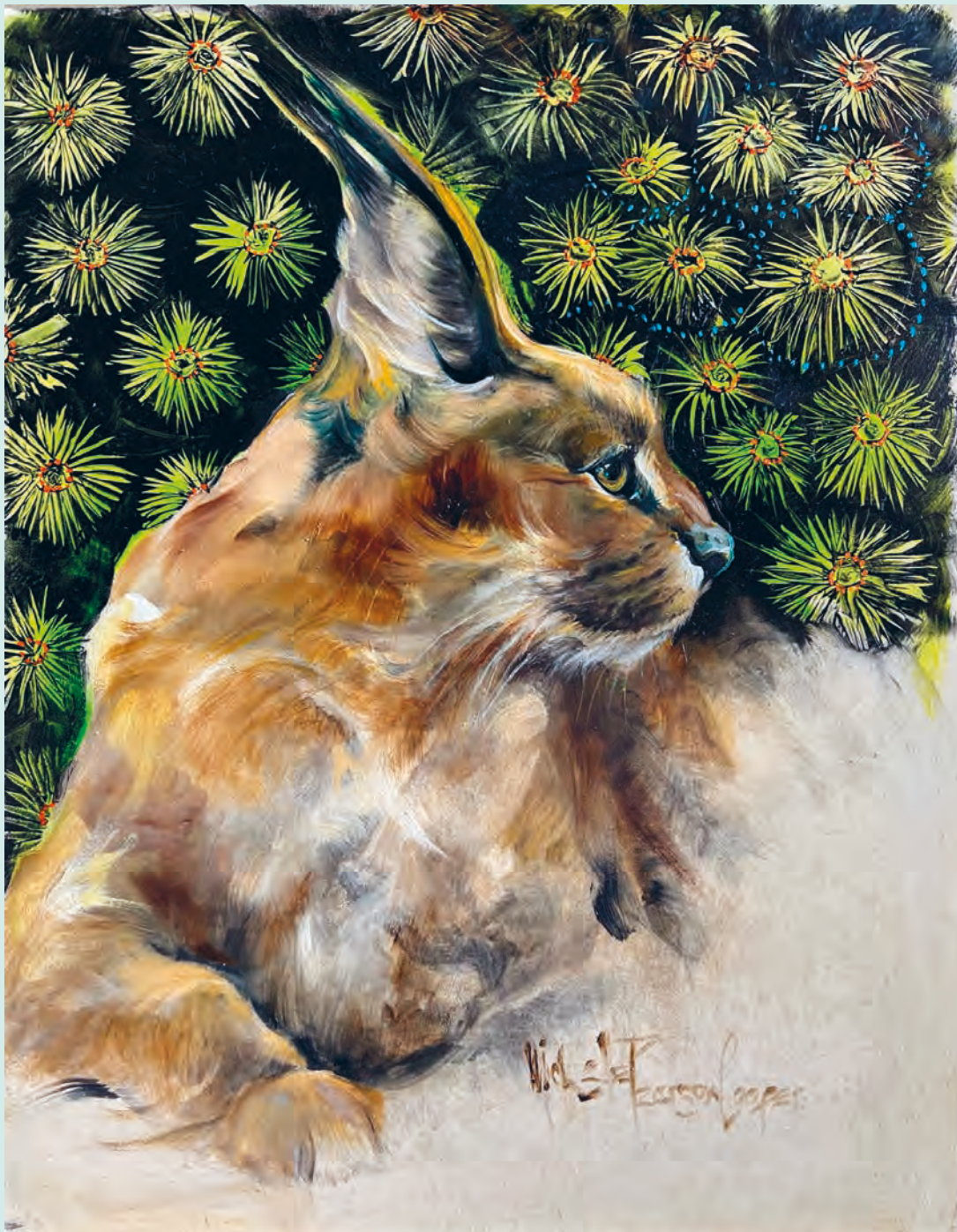
Lynx on Lime Shwe Shwe