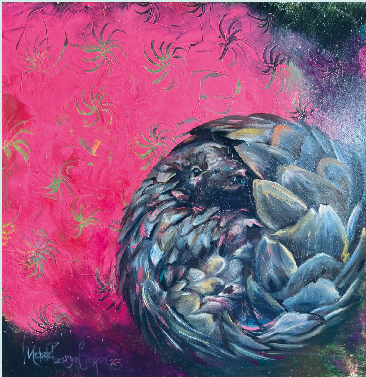
Pangolin on Pink oil on panel, 30 x 30 cm