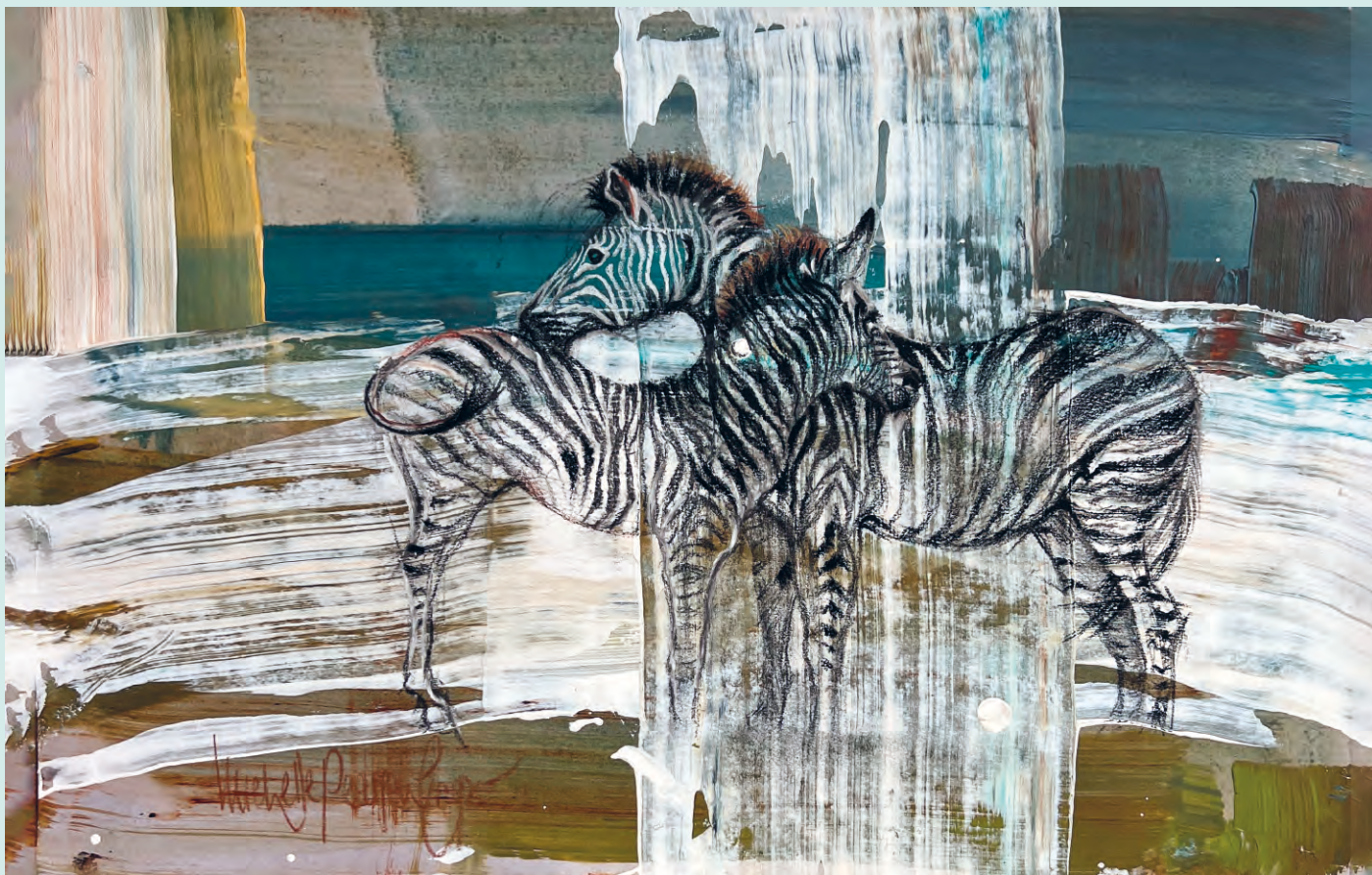
Zebras Entwined on Abstract mixed media, 24 x 37 cm