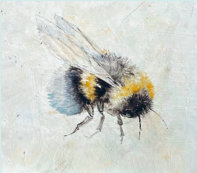
Bee Free oil on gesso panel, 12 x 14 cm