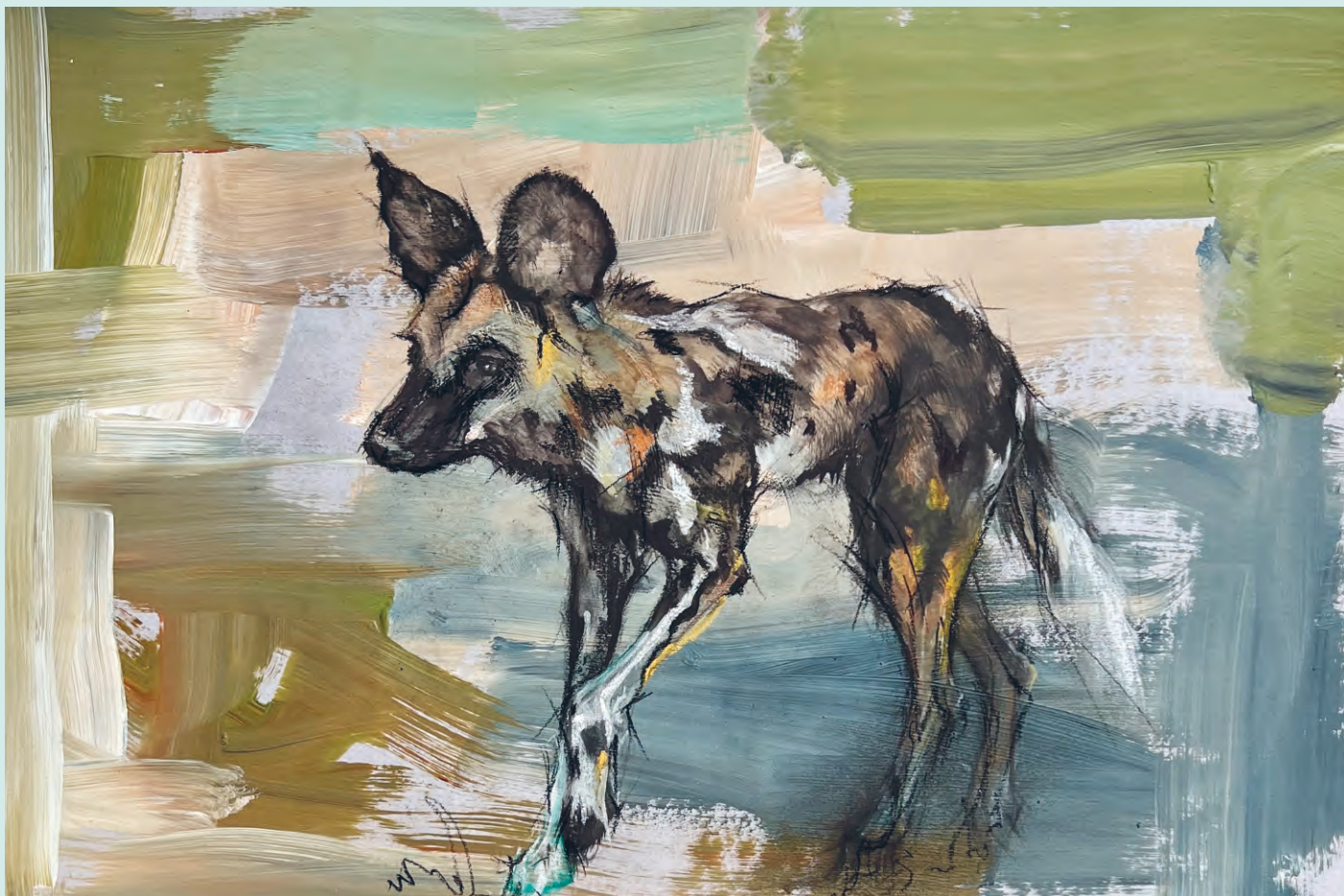
Cape Hunting Dog mixed media, 24 x 37 cm