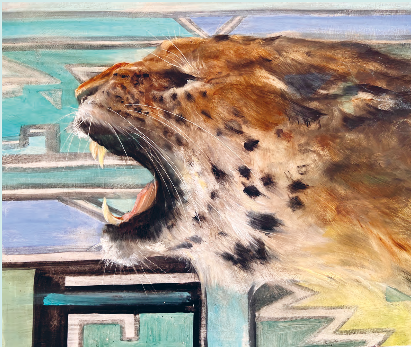
Leopard on Ndebele oil on panel, 30 x 40 cm