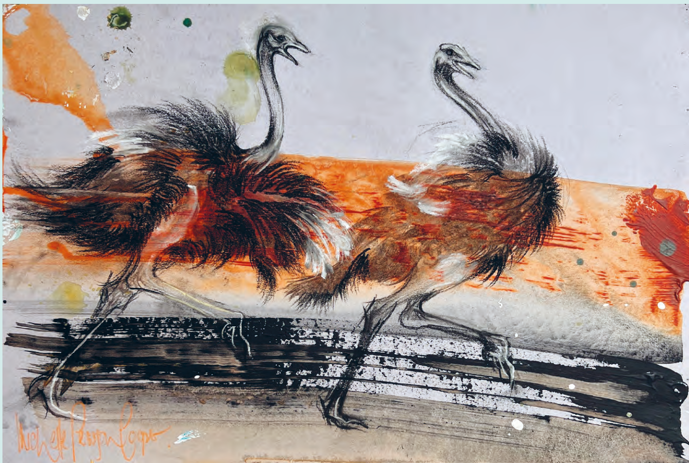
Ostriches on Abstract mixed media, 24 x 37 cm