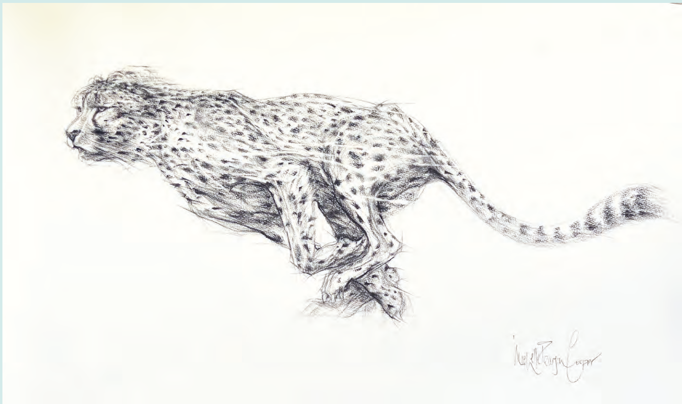
Acinonyx II charcoal on arches paper, 75.5 x 118 cm