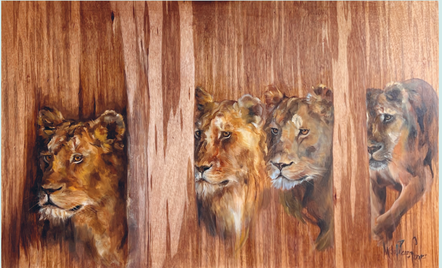
Lionesses oil on wood, 70 x 120 cm