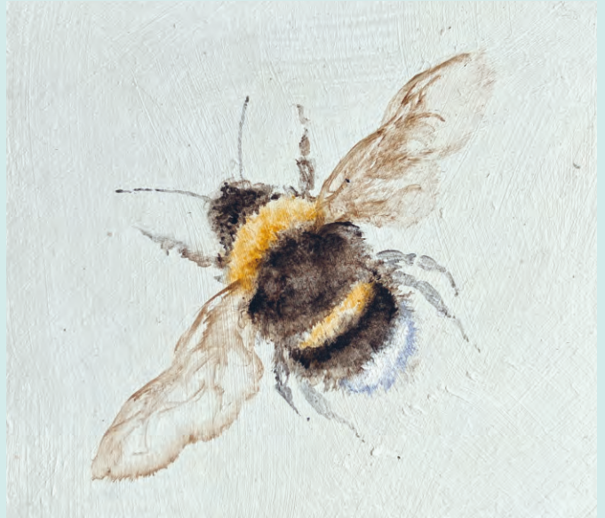
Bee Fore oil on gesso panel, 9 x 10 cm