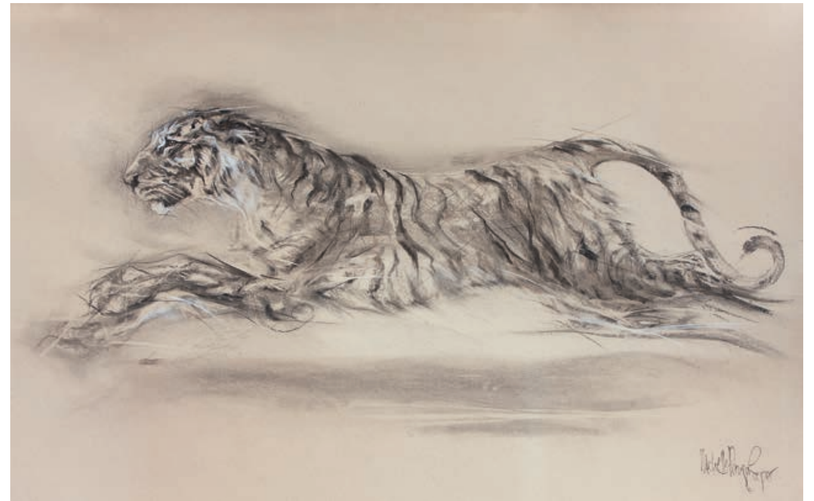
Freedom (Work in progress), Charcoal on card, 65 x 102 cm