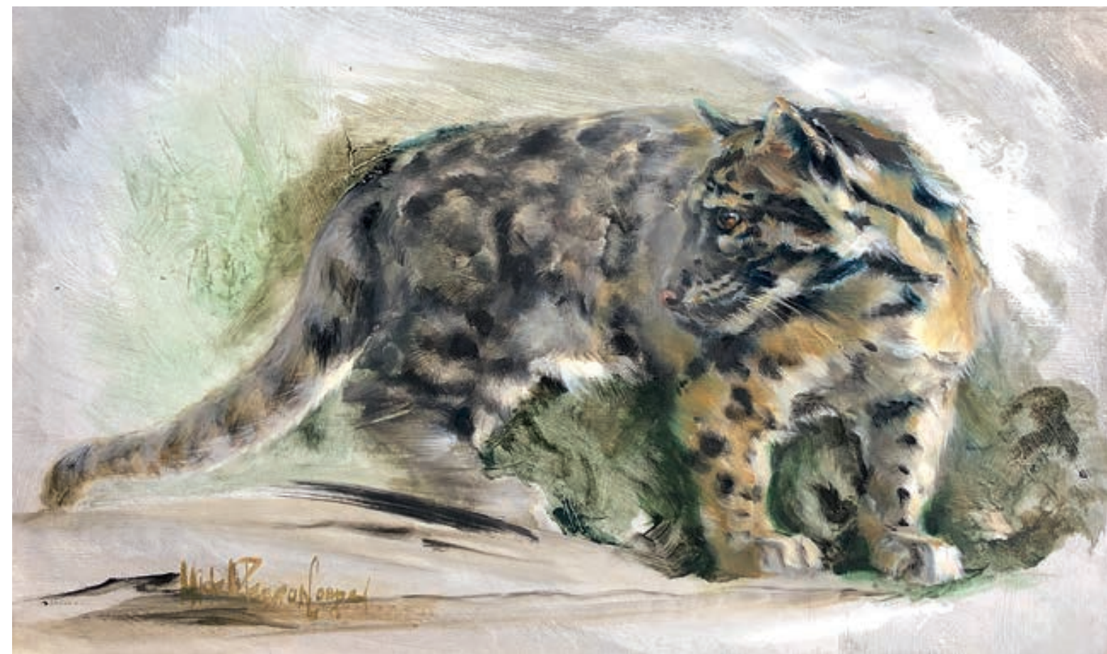
Cloudy Leopard Oil on panel, 26 x 30 cm