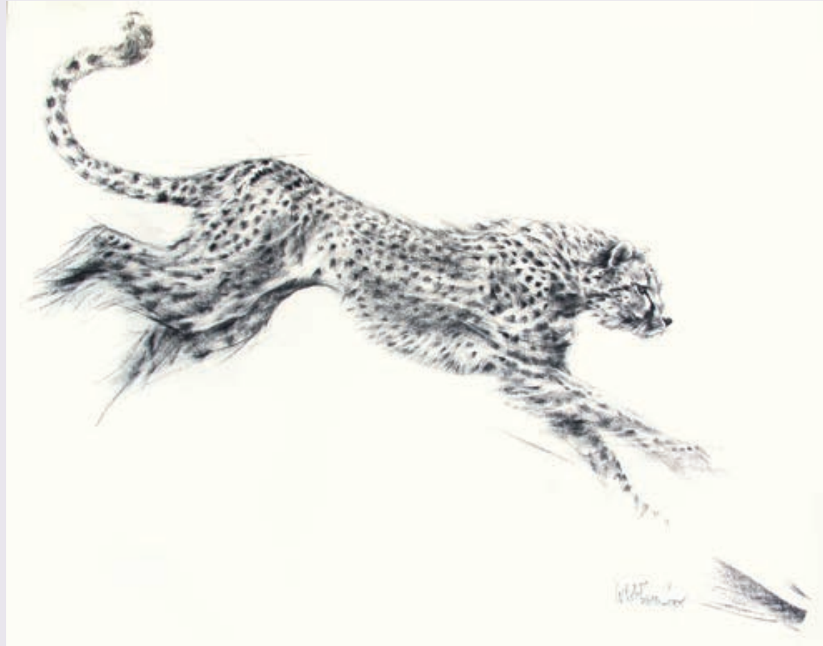
The Chase Charcoal on Fabriano paper, 45 x 58 cm