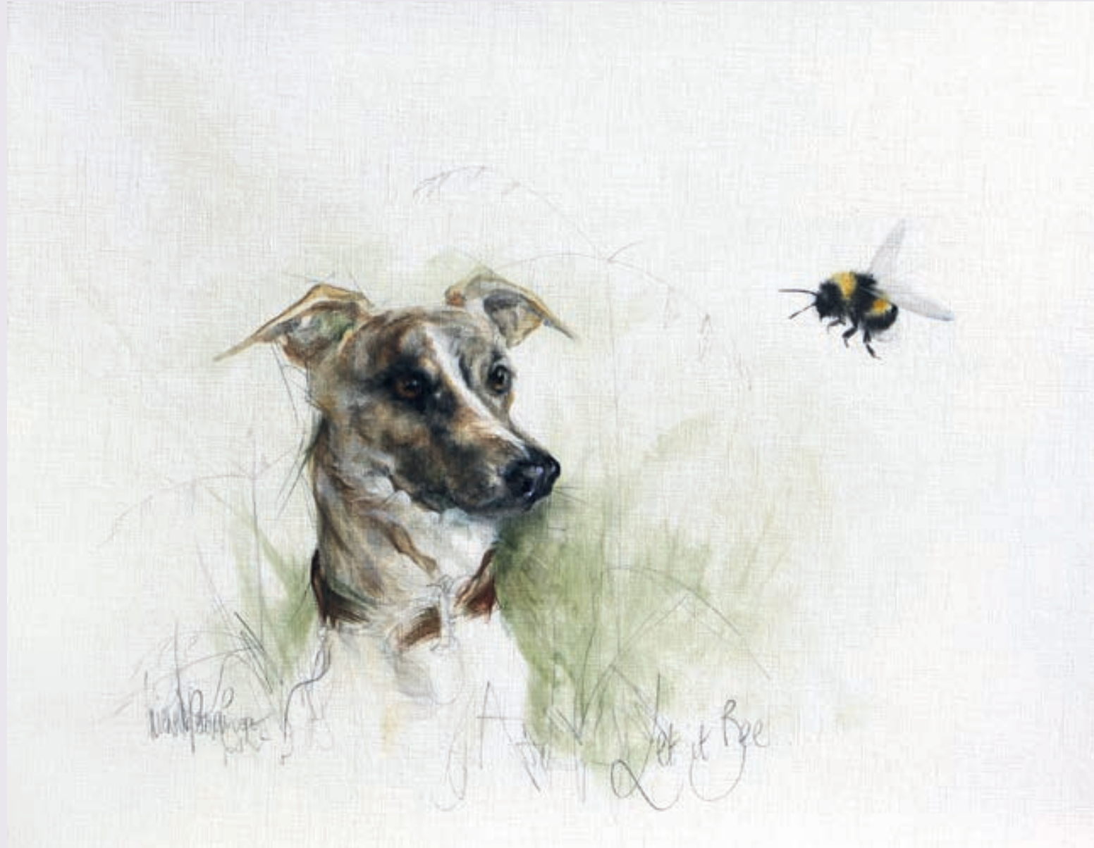
Let it Bee Oil on paper, 40 x 50 cm