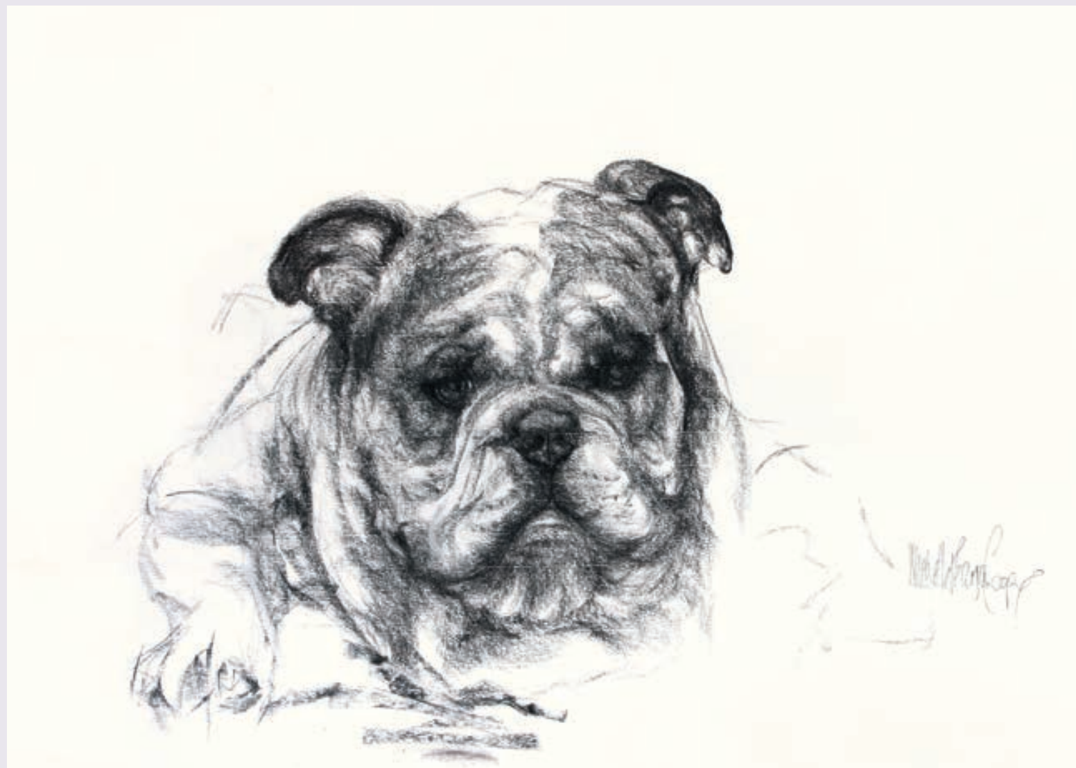
Bulldog Charcoal on paper, 60 x 80 cm