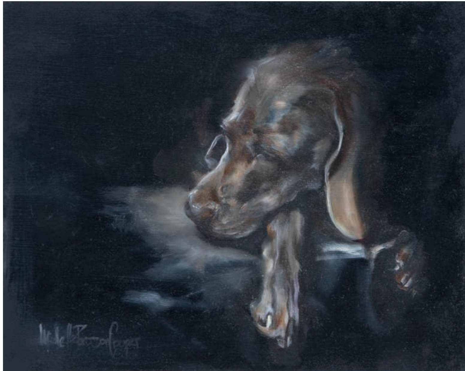
Weimaraner Oil on panel, 30 x 38 cm