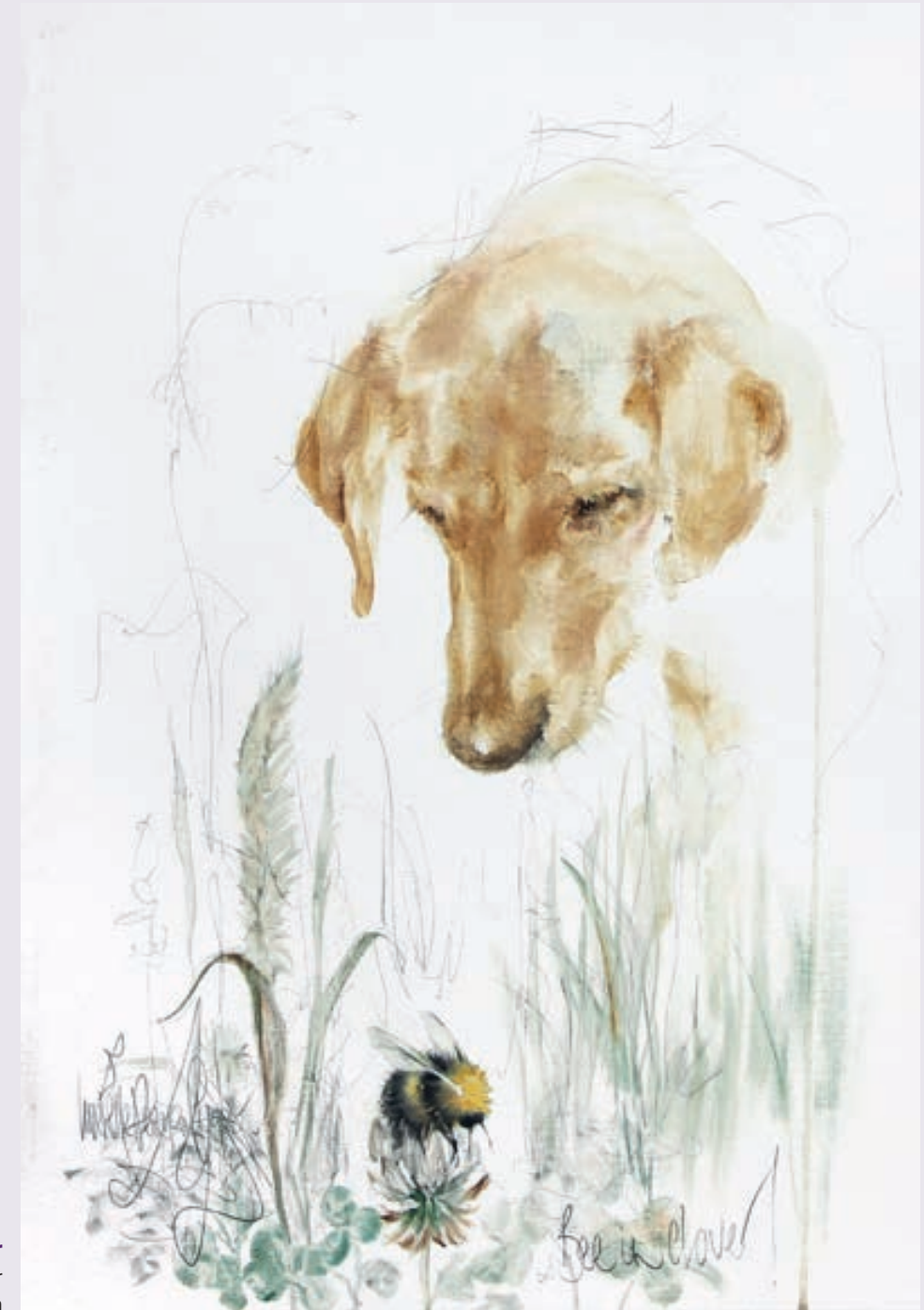
Bee in Clover Oil on paper 40 x 30 cm