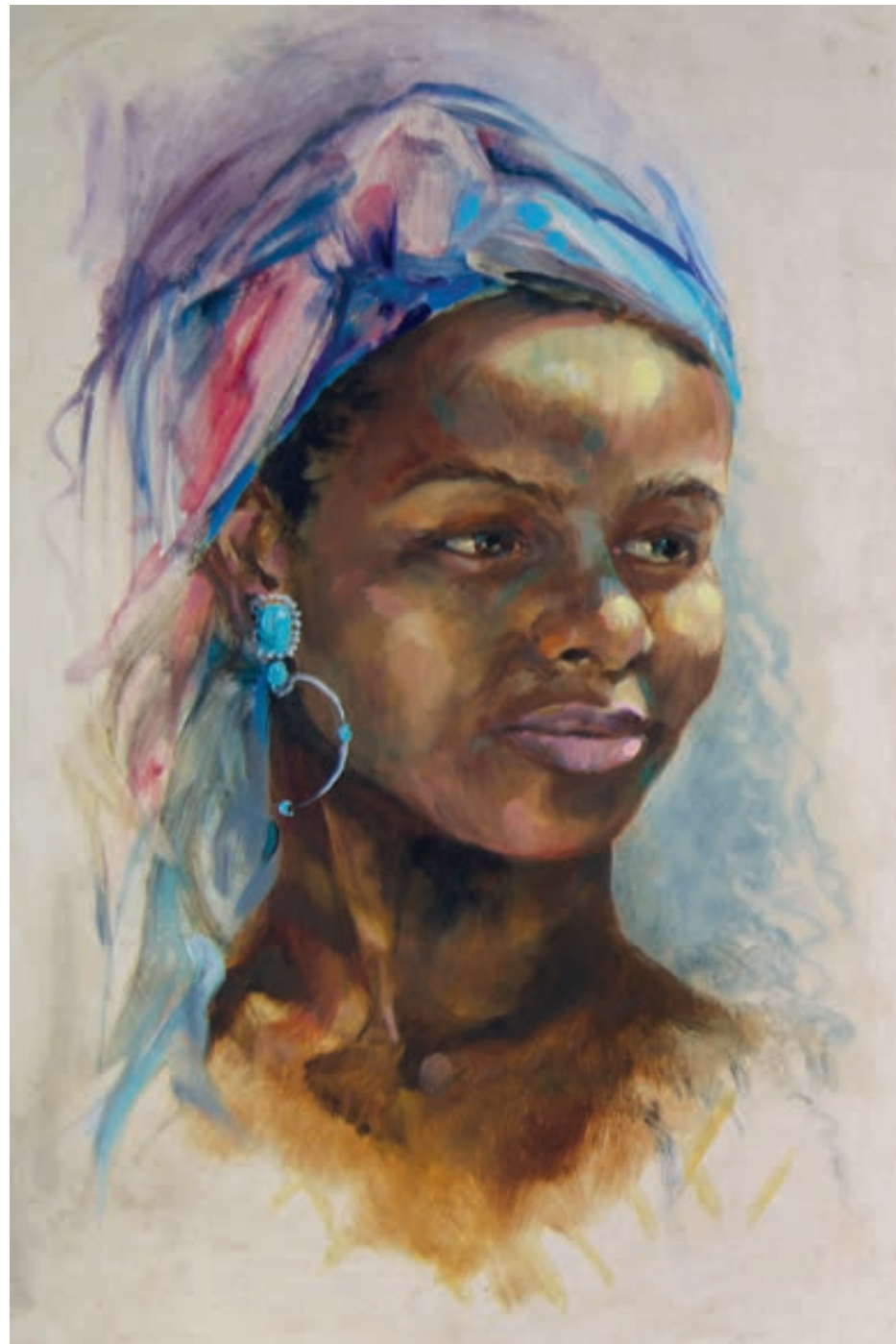
Xhosa Girl Oil on panel 45 x 58 cm