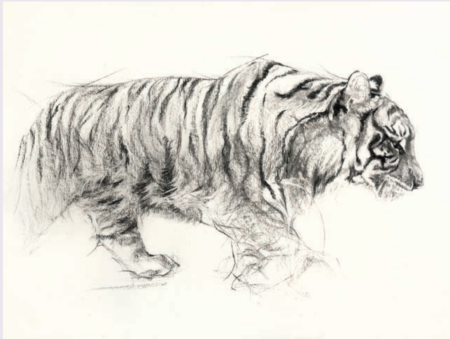
Tiger Charcoal on paper, 80 x 110 cm