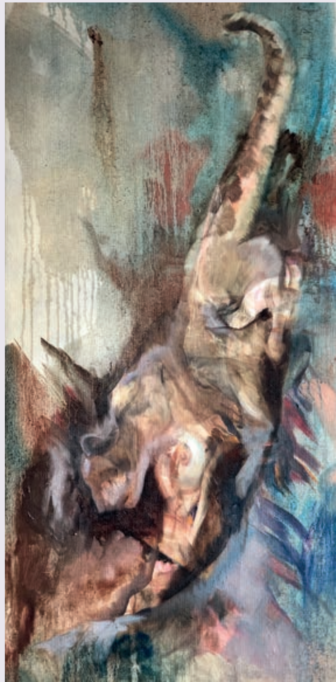
Snow Leopard Evolving (Work in progress) Oil on canvas 97 x 46 cm