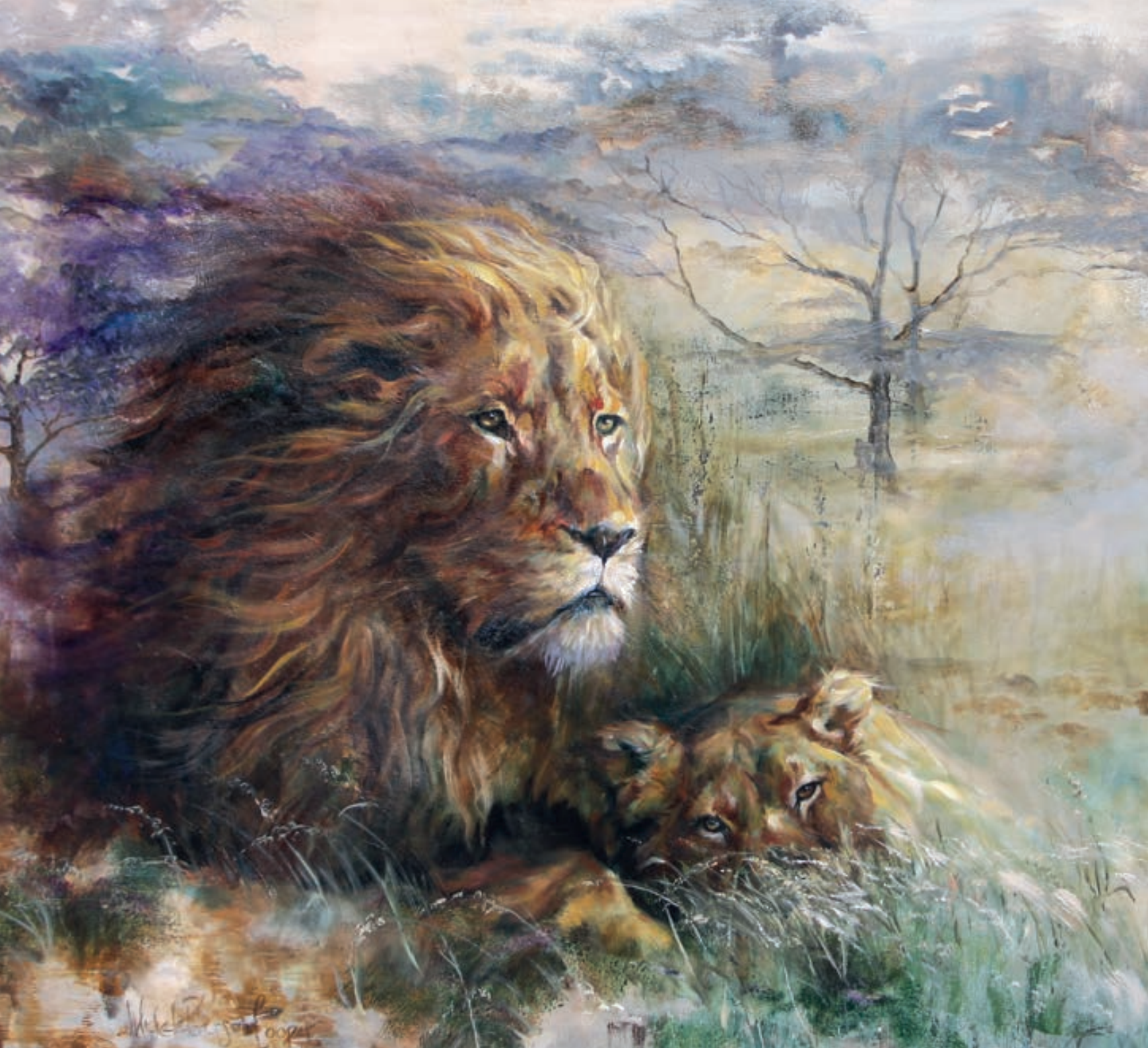
King Keeping Watch Oil on canvas 102 x 127 cm