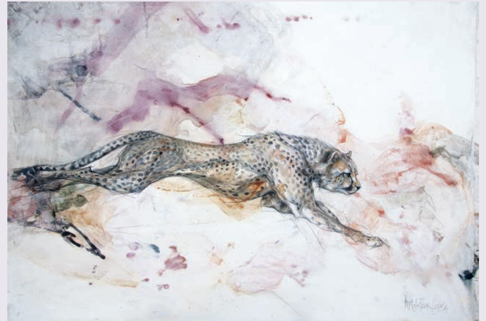
Cheetah Charcoal on watercolour, 56 x 80 cm