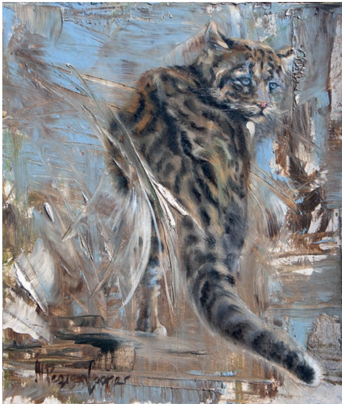
Cloudy Leopard on Abstract Oil on panel 30 x 26 cm