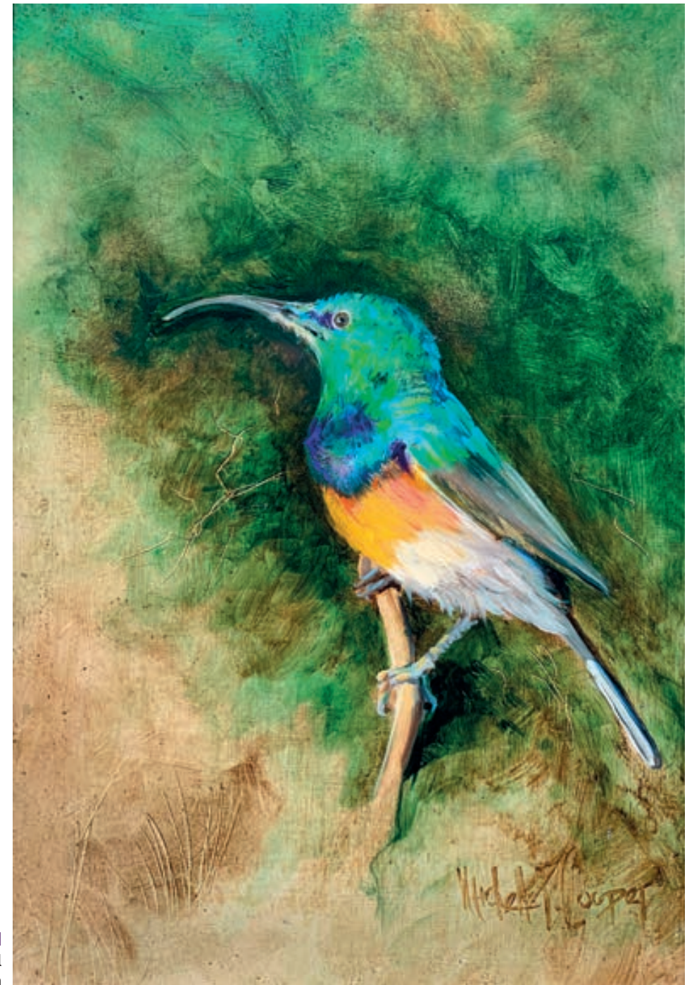
Sunbird Oil on panel 28 x 20 cm