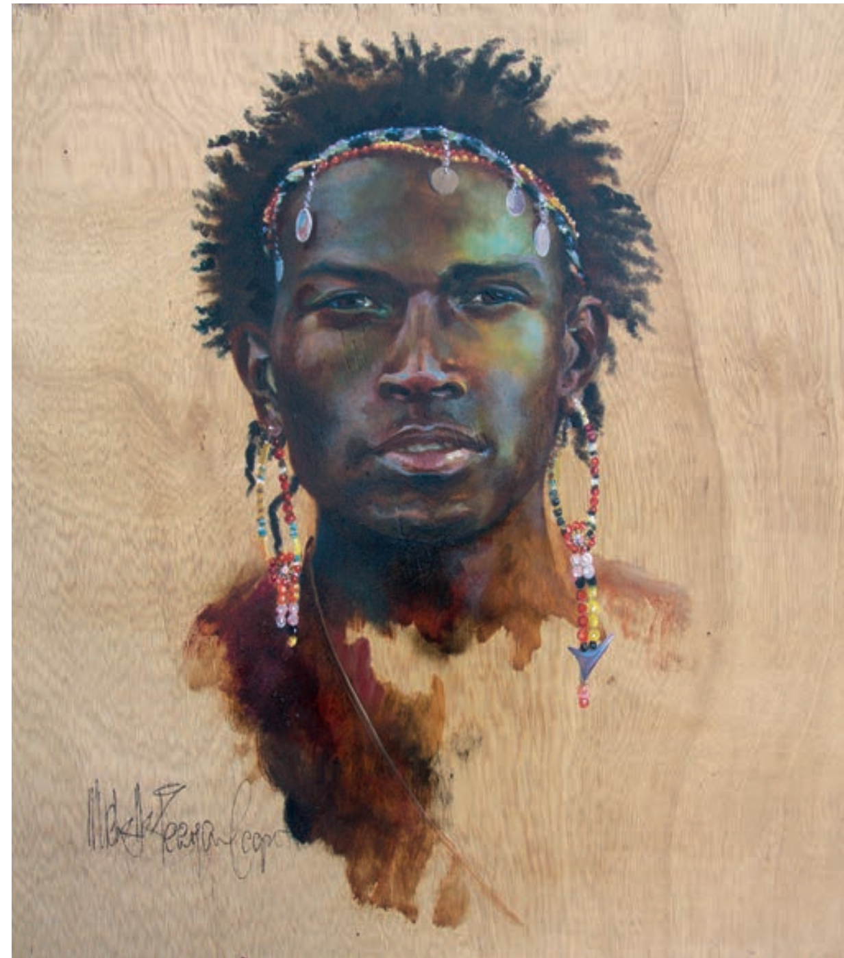
Maasai Oil on wood 40 x 40 cm