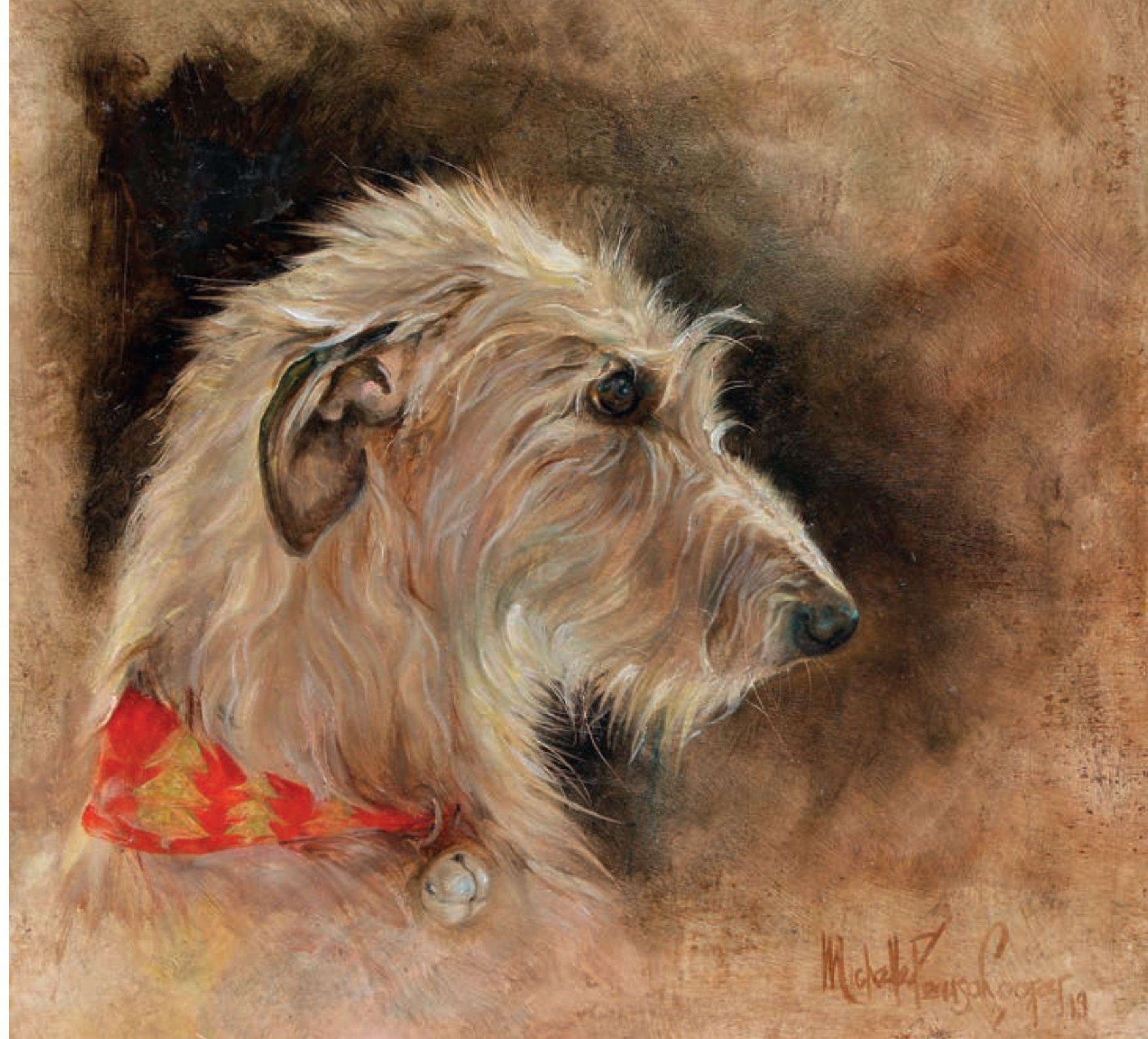
Wizard Oil on gesso panel 40 x 40 cm Commission - NFS