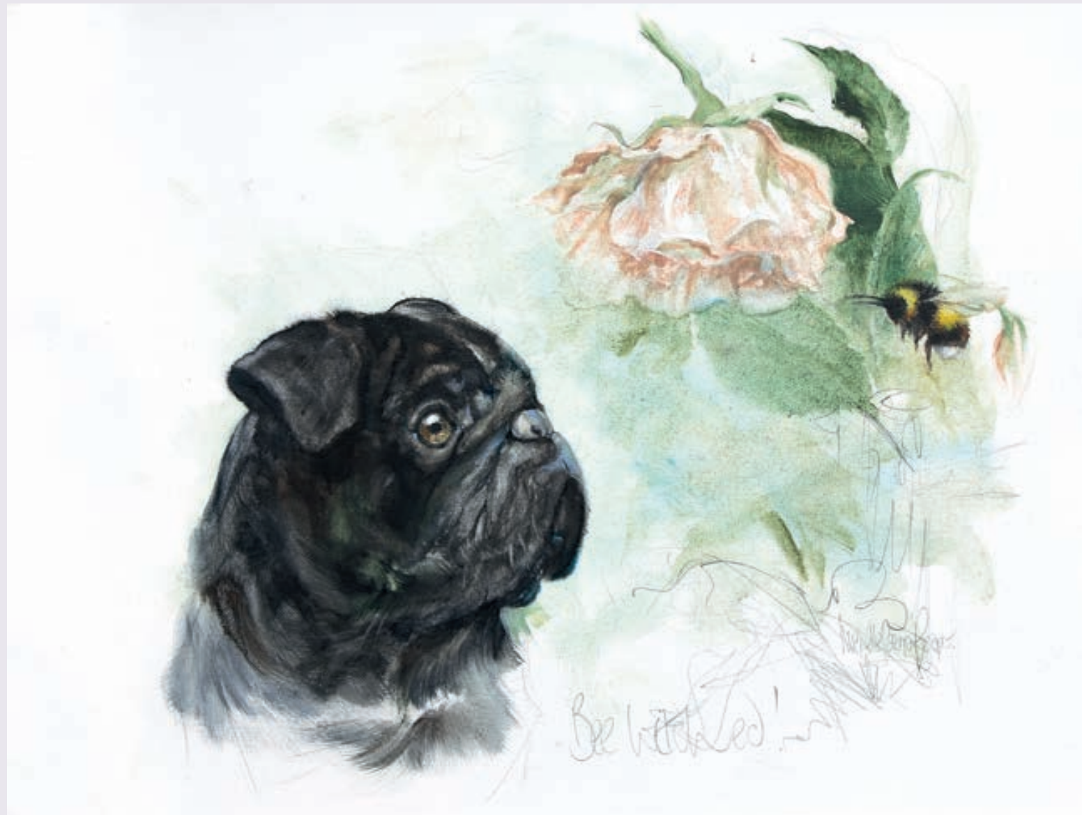
Bee Witched Oil on paper, 30 x 40 cm