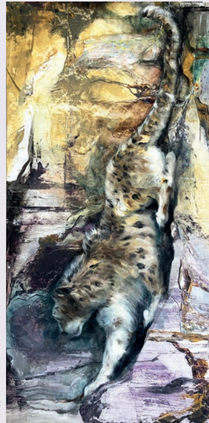
Snow Leopard on Abstract Oil on panel 90 x 50 cm