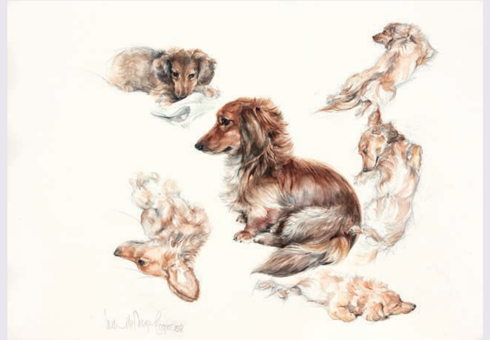
King Ralph Watercolour 50 x 70 cm Commission - NFS