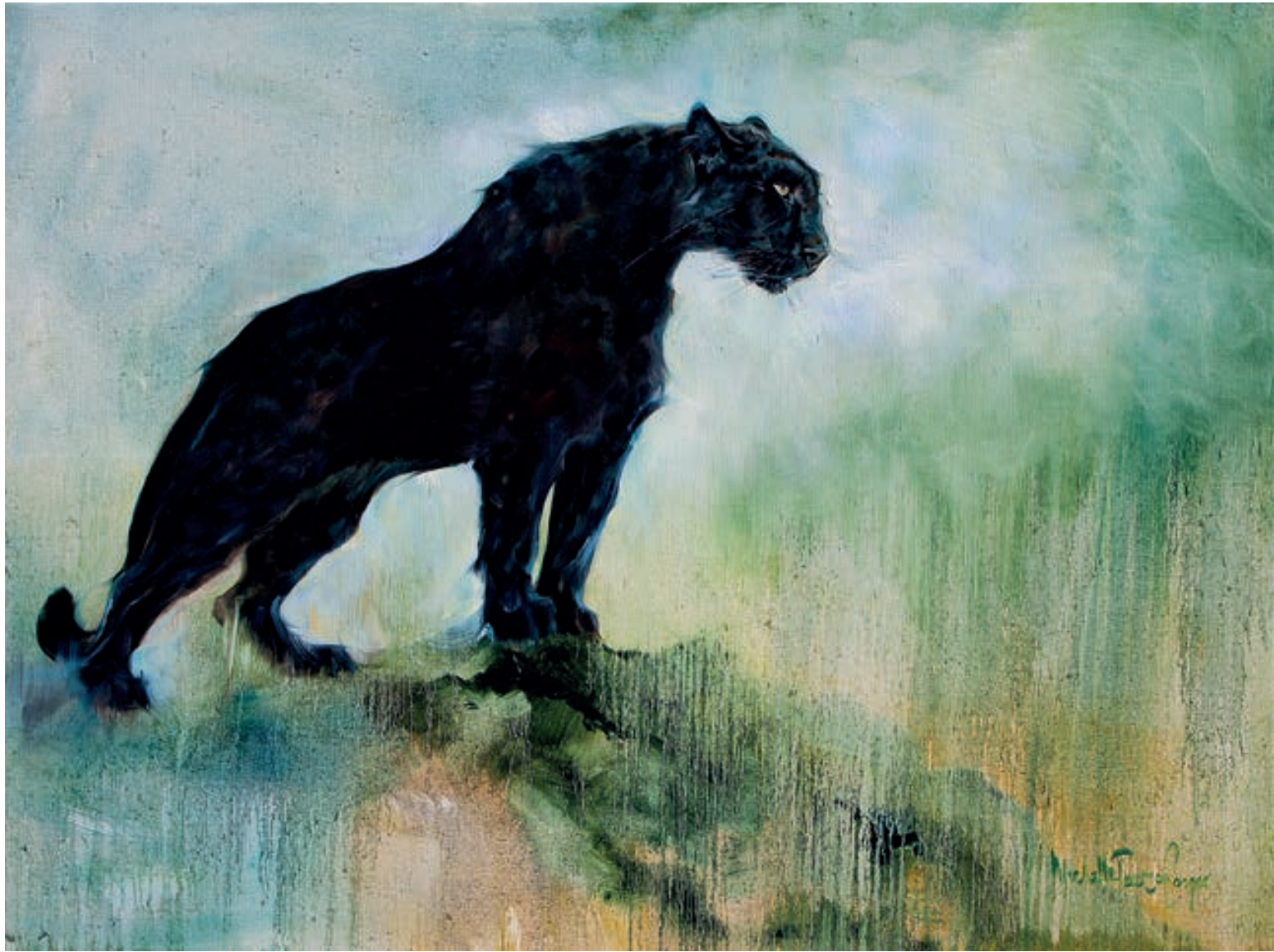
Black Leopard Oil on canvas, 91 x 121 cm