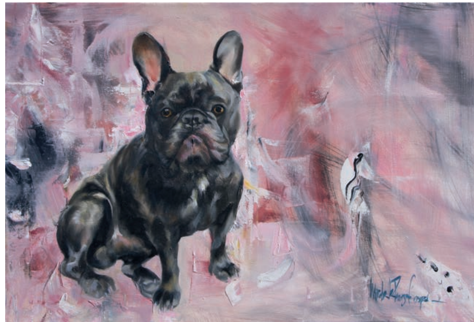
French Bulldog Oil on canvas, 50 x 76 cm