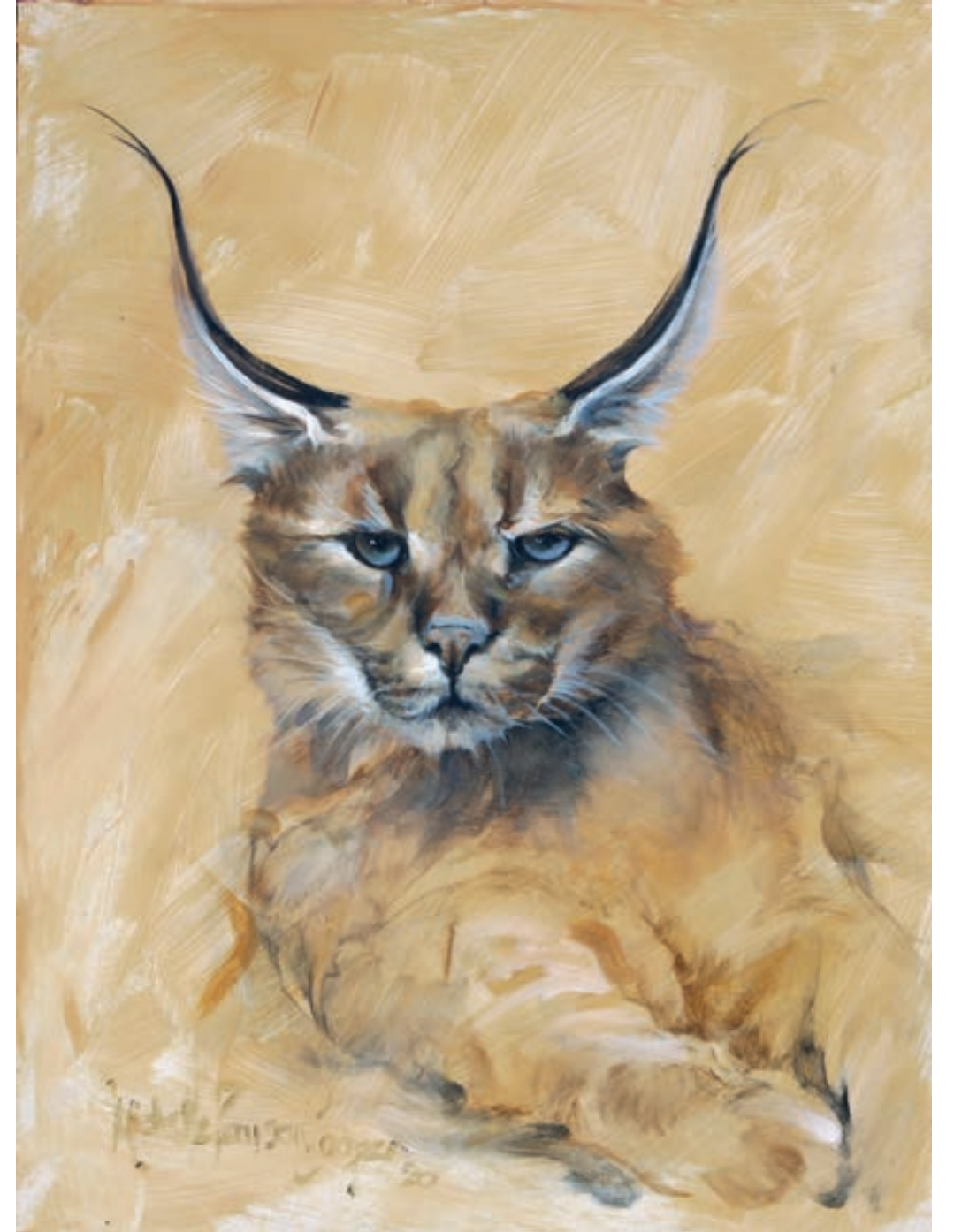
Caracal Oil on panel 40 x 30 cm