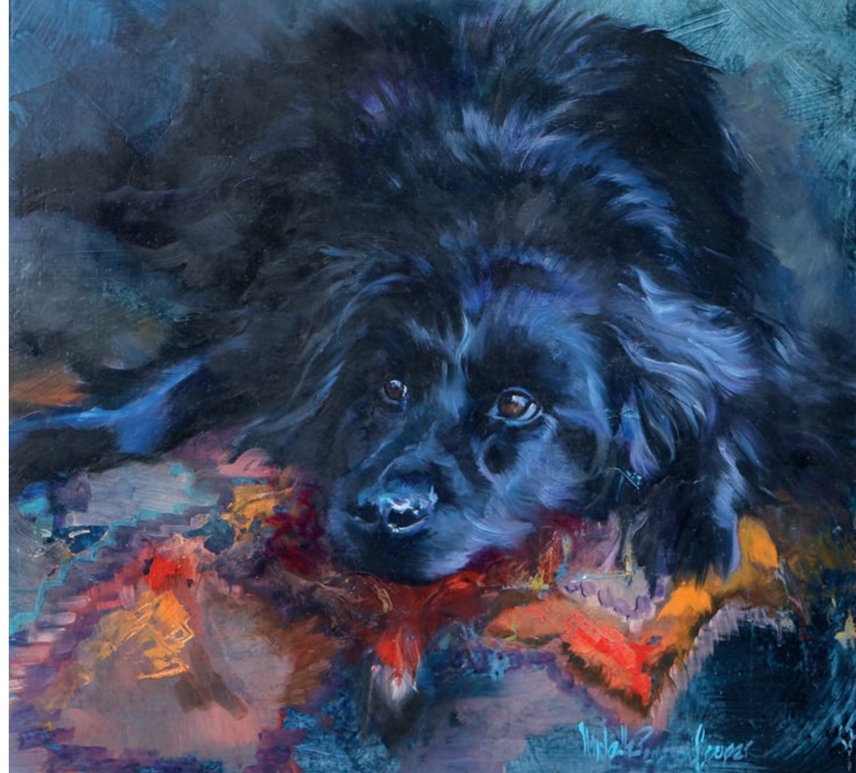
Watching every Move... Oil on panel, 46 x 47 cm