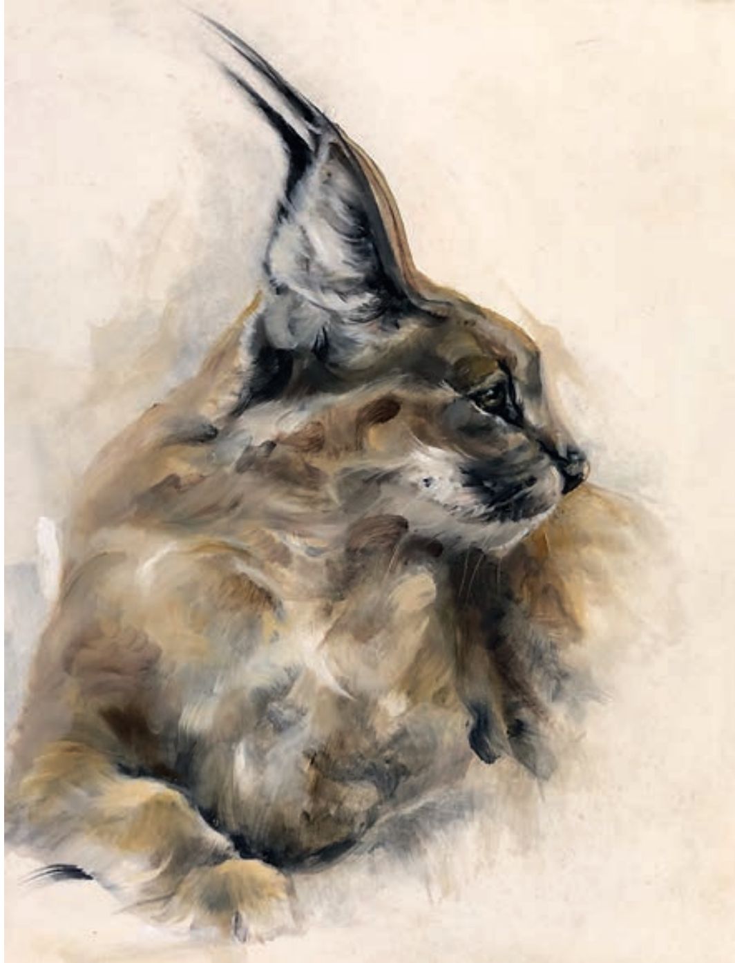
Caracal Profile Oil on panel 35.5 x 28 cm