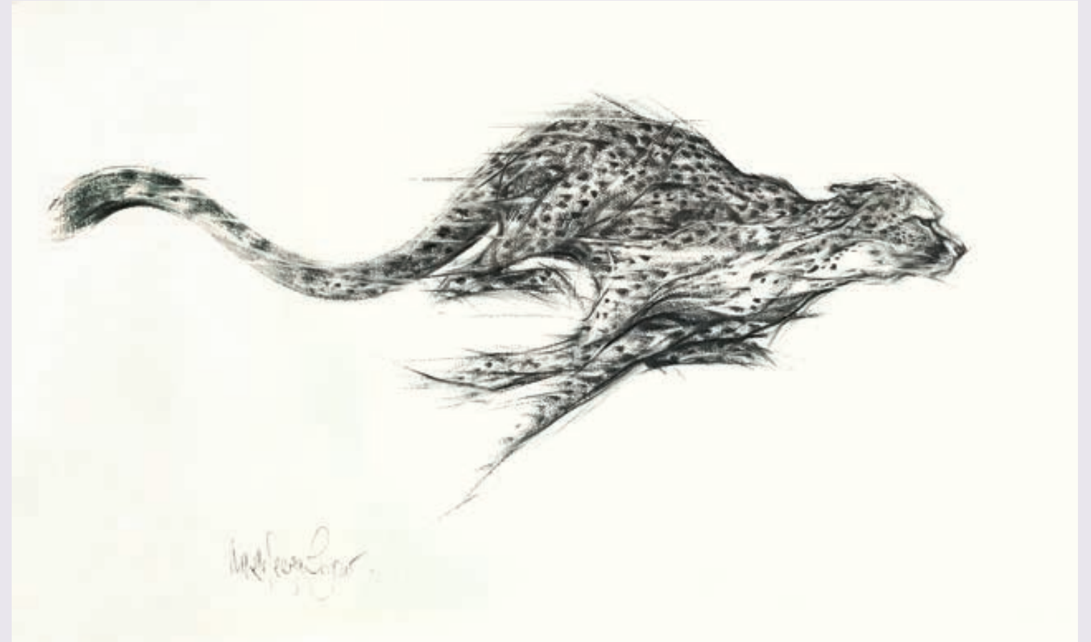
Cheetah I Charcoal on Bockingford paper, 120 x 170 cm